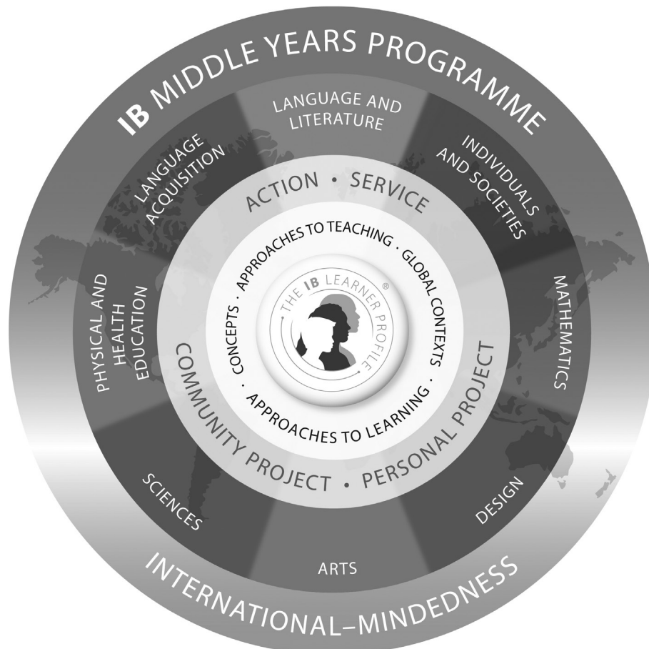
Figure 1 Middle Years Programme model

The MYP is designed for students aged 11 to 16. It provides a framework of learning that encourages students to become creative, critical and reflective thinkers. The MYP emphasizes intellectual challenge, encouraging students to make connections between their studies in traditional subjects and the real world. It fosters the development of skills for communication, intercultural understanding and global engagement—essential qualities for young people who are becoming global leaders.