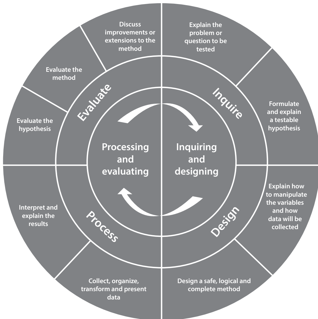
Figure 4 The experimental cycle

The scientific process of inquiring, designing, processing and evaluating is represented by MYP sciences objectives B (inquiring and designing) and C (processing and evaluating). The visual representation in figure 4 shows the dynamic relationship between the four areas of experimental design and reporting.